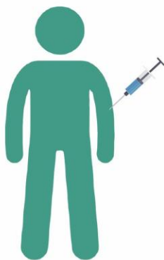
Non-sterile medical interventions; medical procedures in developing countries; and intravenous drug use