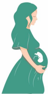
Passed from mother to baby