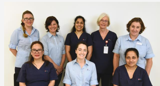
Liver Clinic Nursing Team, Liverpool Hospital

If you are found to have hepatitis B or C, you will be notified either by your GP or one of our Liver Clinic Nurses. Usually further tests are needed for diagnosis and we can help you with treatment and care.